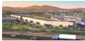
Panattoni Development Co. has completed the first phase of Civic Center Corporate Park in North Las Vegas, Nev.

Sacramento, Calif.-based Panattoni Development Co. has completed construction of the first phase of Civic Center Corporate Park, a $25 million master-planned business park in North Las Vegas. Located at the corner of Civic Center Drive and Alexander Road, the first phase consists of 16 for-sale or for-lease industrial units ranging in size from 4,008 to 8,652 square feet. Each unit features two docks and one grade-level door. The final 14-acre project will include four buildings ranging in size from 16,000 to 100,000 square feet.