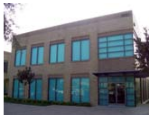
NAI Capital and Voit Commercial have brokered the $3.96 million